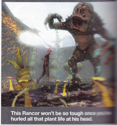
This Rancor won't be so tough once you've hurled all that plant life at his head.