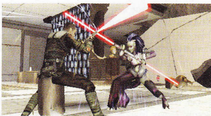
Don't look for this duel on the PS3—it's part of five missions that are exclusive to the PSP and PS2.

Indeed, the environments are flush with items you can rip from the walls (and floors and ceilings, too)—which is extremely impressive for a PSP game. The game also looks great, and the Lightsaber-heavy combat and Dark Side storyline are compelling throughout, even though the load times are long, the hit detection inconsistent, and the copious quick-time events feel shoehorned in.