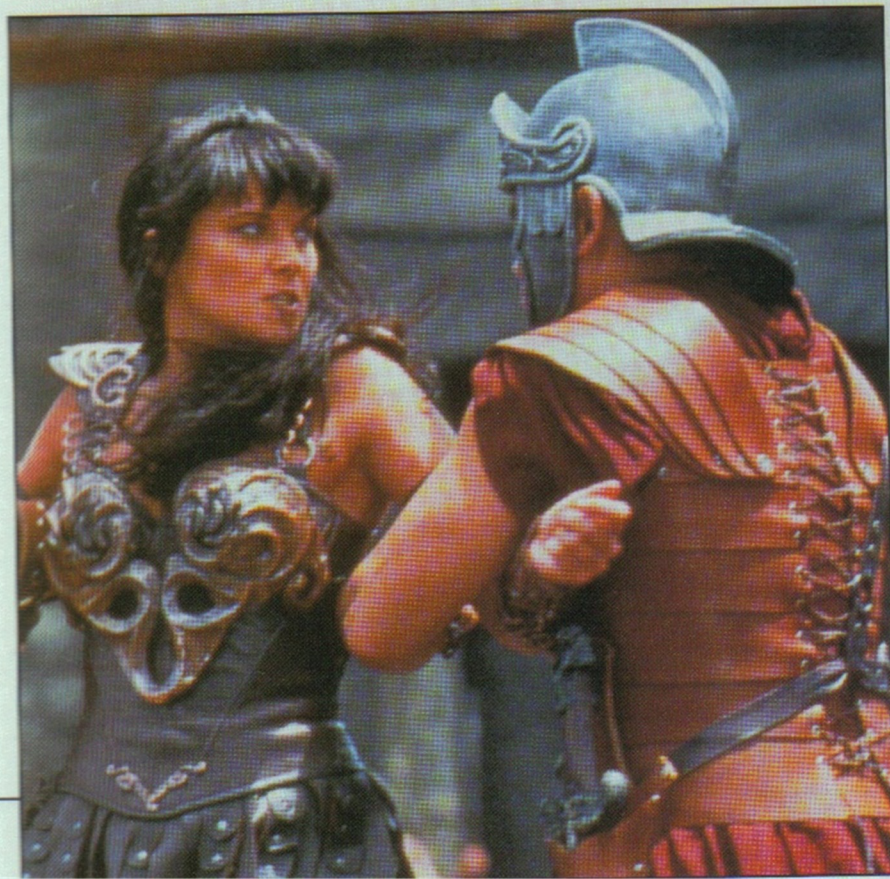
Above: Like her daughter, Xena has also taken centre stage in the Roman arena.